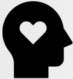
Mental Health Support